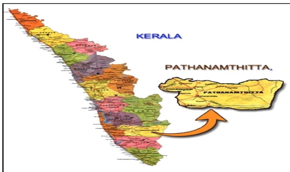
Fig.1: District Map of Pathanamthitta

Under the three tier system of panchayat in rural areas, Pathanamthitta has one district panchayat, 8 block panchayat and 54 gram panchayats. The headquarters of the district panchayat is also at Pathanamthitta. Under the single tier system of municipality in urban areas, Adoor, Pathanamthitta and Thiruvalla are the 3 municipalities the district. Kozhencherry is a census town. Pandalam, Ranni, Konni, Mallappally, Koipuram-Kumbanad, etc. are the other major towns.