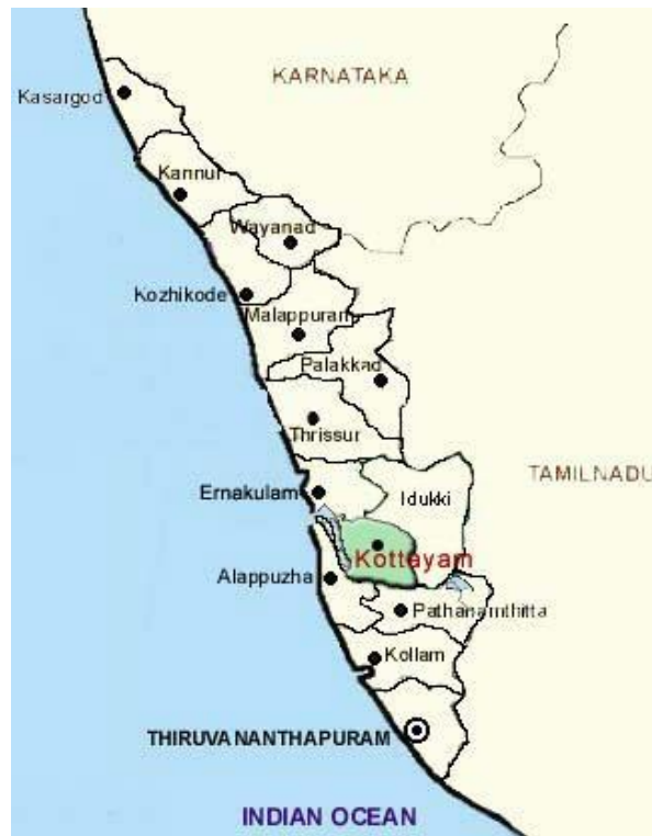
Fig.1: Location of Kottayam District

Changanassery and Kottayam Taluks have Aluvial soil. The district has no coastal area.