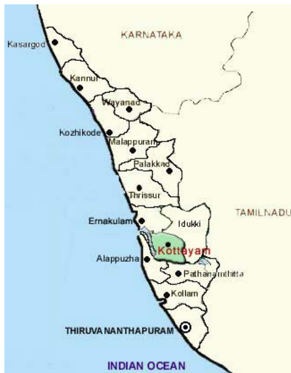
Fig.1: Location of Kottayam District

part of Changanassery and Kottayam Taluks have Aluvial soil. The district has no coastal area.